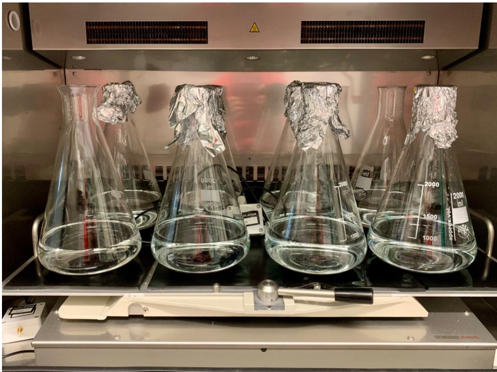
Figure 3. The Kuhner unit filled with 8 Erlenmeyer flasks.