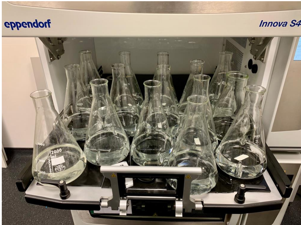
Figure 4. The Eppendorf S44i filled with 15 Erlenmeyer flasks.