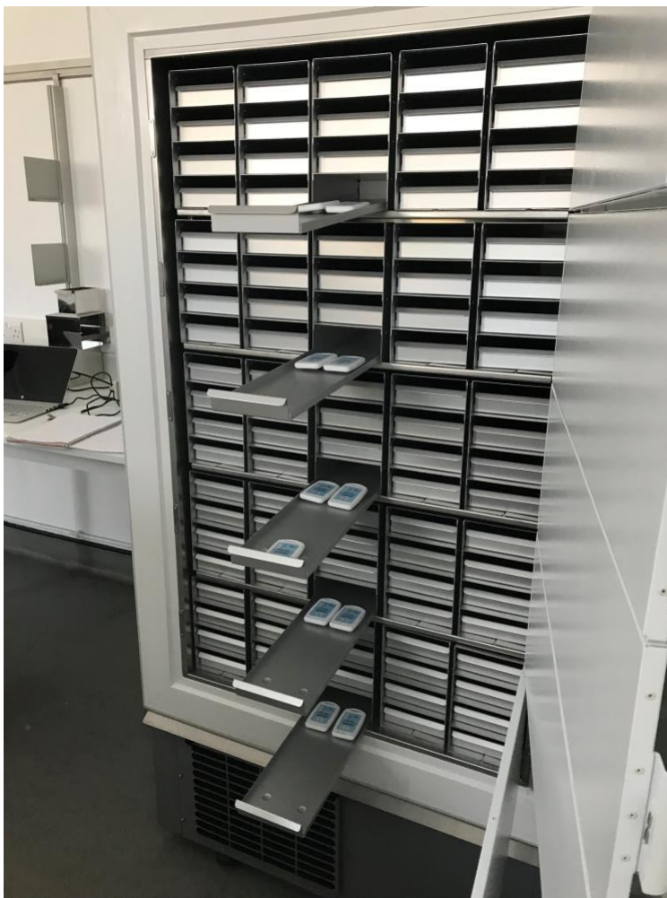
Figure 1. ULT freezer fully racked with temperature loggers in place.

Ultra Low Temperature (ULT) freezers are a predominantly used in life sciences for the long term storage of valuable samples and products. The use of racking can vary between organizations with some ULT freezers being completely racked (figure 1) whilst others are devoid of any racking whatsoever. Racking can be made of aluminium or stainless steel. This study completes the case study from October 2018 by repeating the procedure using the same conditions, location and freezer unit, this time using stainless steel racking. This study now compares the impact of different types of metal racking upon the temperature and energy performance of a ULT freezer at the -80C set point.