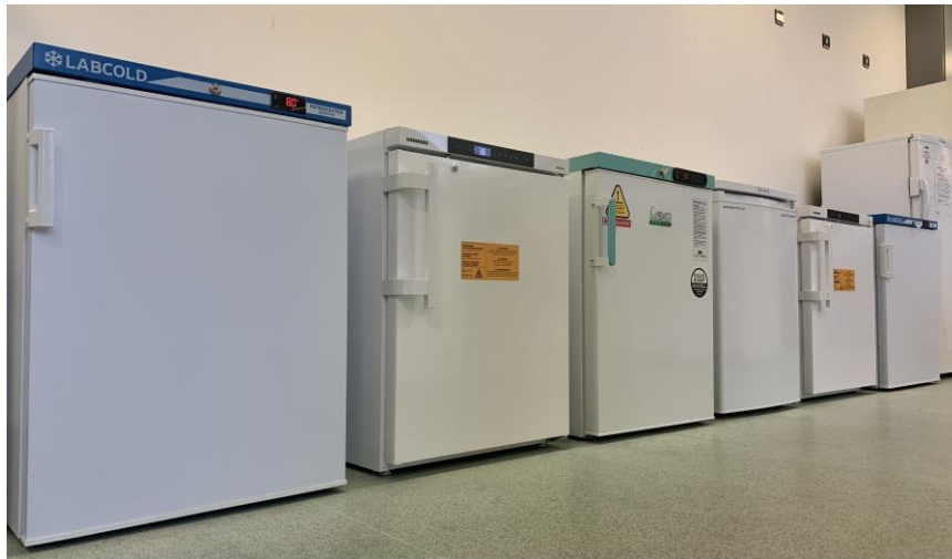
Figure 1. The three fridges and three freezers examined at the Learning and Research Centre, University of Bristol.

Fridges and freezers are widespread throughout scientific research and teaching. They are found in molecular sciences, life sciences, chemistry and stores departments throughout the UK. A range of models are available and lab operators may choose from a selection of units which will vary in their price & performance. With labs aiming to minimize their running costs, highlighting the models with the lowest running costs is a useful exercise. However, energy consumption values alone would not be serving end user requirements. This study aimed to highlight some of the data and criteria which should be considered when selecting the most sustainable solution based on the specific needs of the researcher, their laboratory and the materials they are storing.