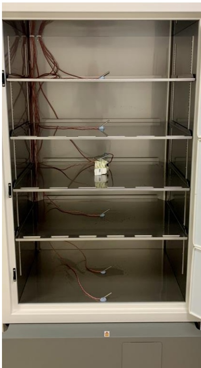
Figure 1. The F740hi with probes positioned at the centre of each shelf. Furthermore, additional probes were positioned at the back of the top compartment (compartment 1) and the front of the bottom compartment (compartment 5). Compartment 3, the middle compartment, had its probes positioned to be exactly at the middle point of the cabinet.

Ultra-Low Temperature (ULT) freezers are well known to be high consumers of energy. Holding set temperatures 90°C to 100°C colder than their environment will always require a significant amount of energy. One way to reduce ULT freezer energy consumption is to warm up the set temperature. By doing so energy consumption will be reduced from 18-34% depending on the model, age & condition of the freezer. When considering warming up their ULT freezers, some end users raise concerns that by taking such an action they may expose their samples/contents to unfavorable temperatures during their day to day operation.