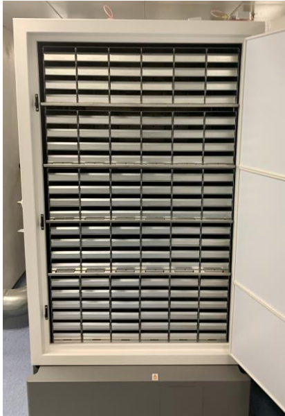
Figure 2. The F740hi filled with aluminium, front opening racking.